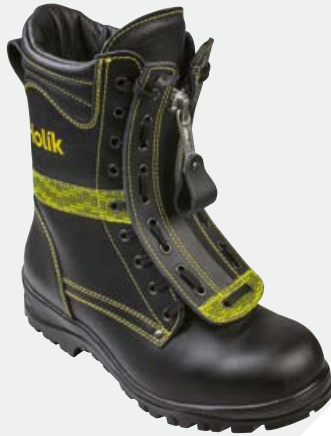
RUSAVA RUSAVA Basic standard line