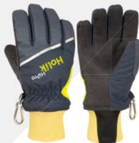
MARIS Short Beige