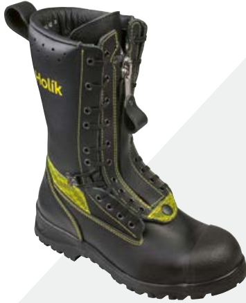
LUKOV Plus LUKOV LUKOV Basic standard line