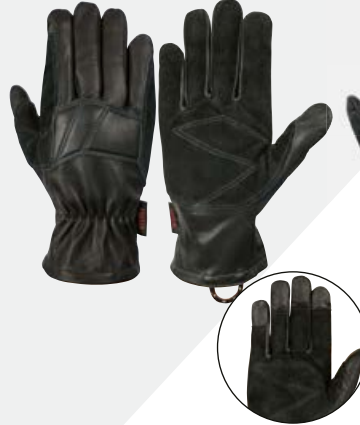
REBECCA Fast Rope REBECCA